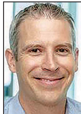
Gates: "A very frothy market"

The 150 companies on the list collectively retailed 3,466,636 new vehicles, an increase of 8.3 percent vs. 2020. Their combined retail and fleet sales were 3,652,826 new vehicles, or 24.3 percent of the industry's total new light-vehicle sales of 15,060,287 in 2021.